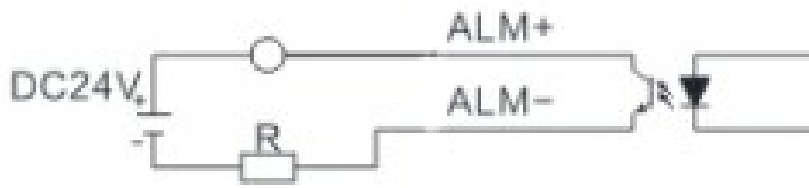
Alarm in place output wiring diagram